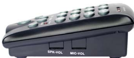
volume controls receive and transmit