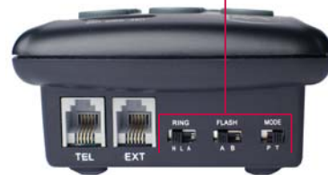
adjustment settings telephone jack extension jack