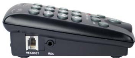
headset jack recorder jack