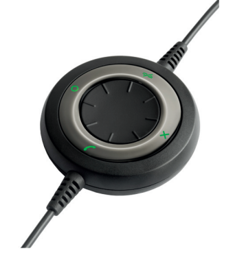
TOGGLE WHEEL AND PROGRAMMABLE SOFT BUTTONS

GN Netcom is a world leader in innovative headset solutions. GN Netcom develops, manufactures, and markets its products under the Jabra brand name