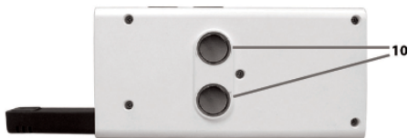
SUPERTOOTH LIGHT (Back View)